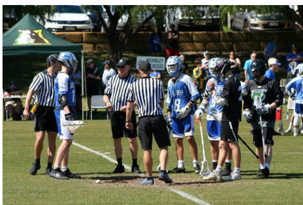
Referees for 15's Boys Grand Final

I wish our aspiring men's World Championship referees and assessors the best of luck as they wait to hear if their nominations for Israel in 2018 have been approved.