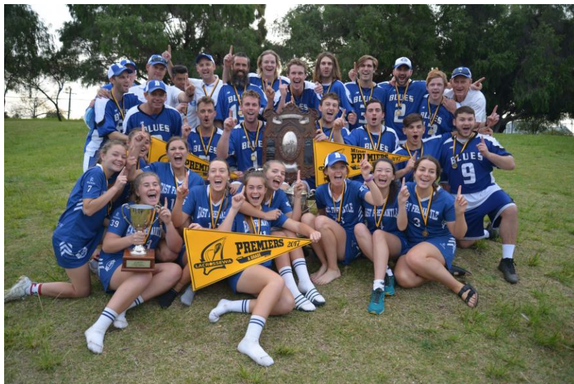
2017 State League and A Grade Premiers