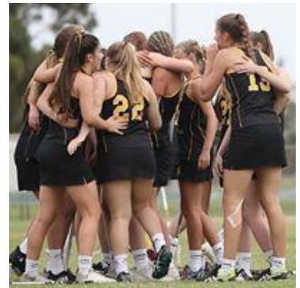
Back to Back U18 Girl's National Champions