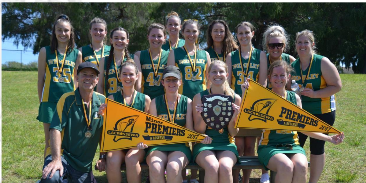
2017 A Reserve Premiers - Wembley Lightning