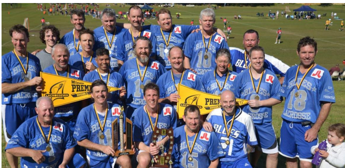
Division 3 Premiership Team - East Fremantle