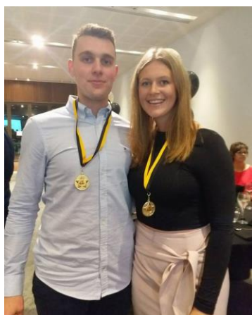
2017 LWA All Stars