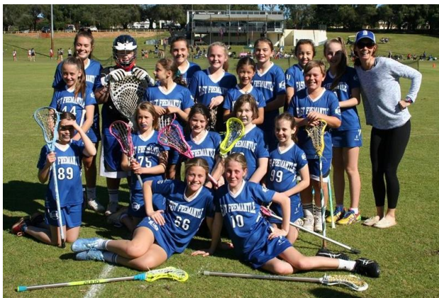
East Fremantle/Subiaco Girl's 13's Team

When asked to consider standing, my primary motive for taking on the role was simply being able to satisfy the question; “what could I do for the club to make the club better?”