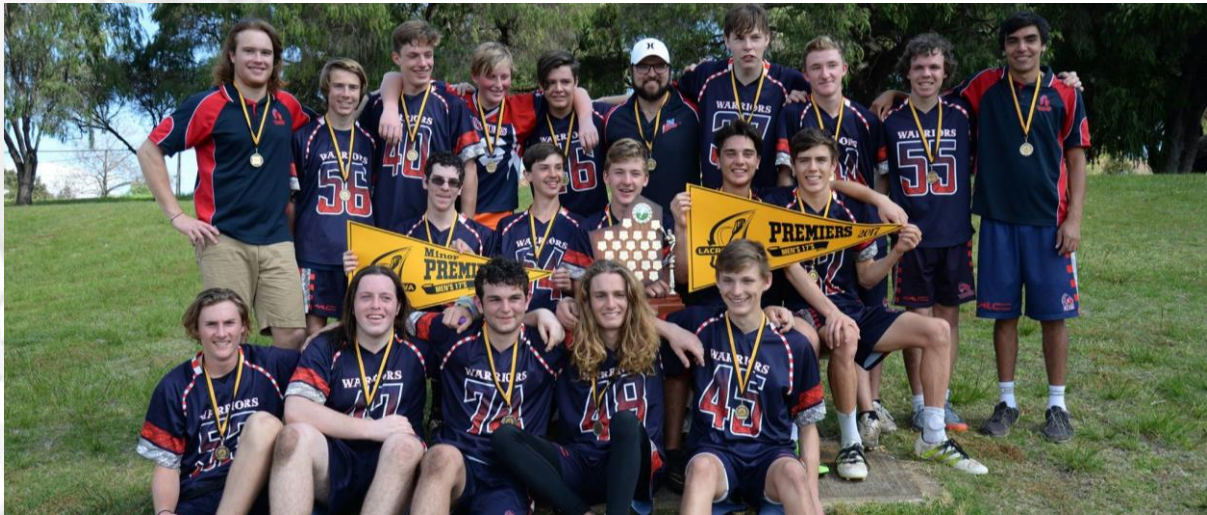
Men's 17's Premiership Team - Wanneroo-Joondalup

Ramsay Trophy Greg Wheatley Trophy Jeff Kennedy Trophy