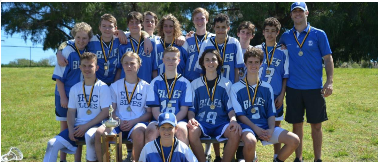
Men's 15's 2017 Premiership Team - East Fremantle

Brian Griffin Trophy Rob Taylor Trophy Steve Mounsey Trophy