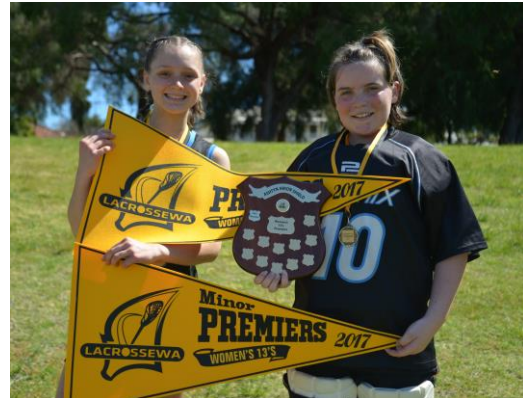
2017 Minor Premiers and Premiers Boy's and Girl's 13's Teams

It is however appropriate for me to mention our successes this season: