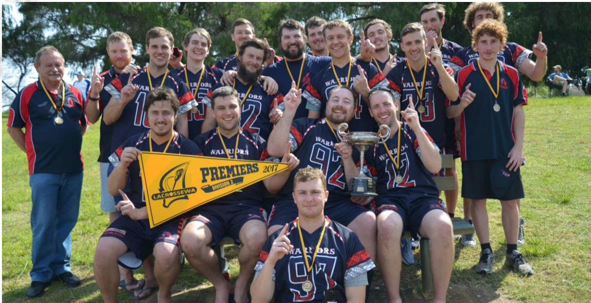
2017 Division 2 Premiers - Wanneroo-Joondalup Blue

Jubilee Trophy Clarke Cup Morris & Scott Trophy Cyrill Allman Medal