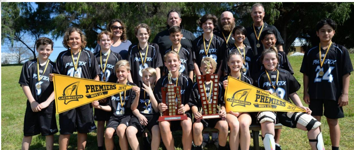
Men's 13's 2017 Premiership Team - Phoenix

Premiers Trophy Minor Premier's Trophy Murray Keen Trophy