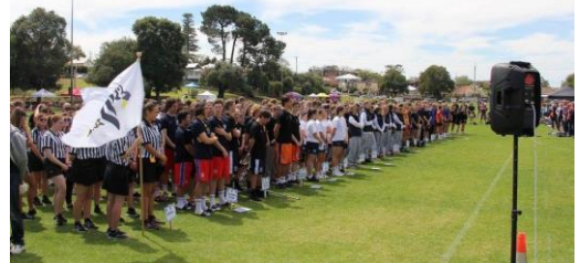
Opening Ceremony – 2017 ALA U15's Tournament