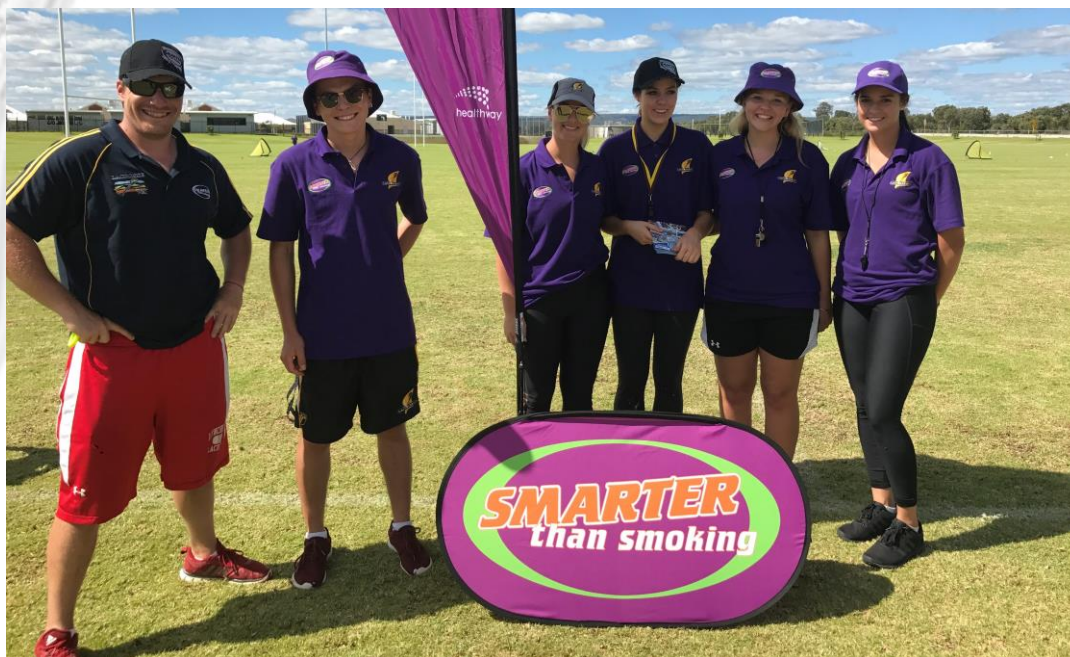
LWA "Smarter Than Smoking" Development Officers