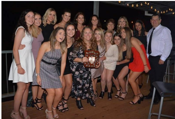
Bayswater's 2017 "Best Club Team" – Union

Thank you again for all your support this season, we look forward to being bigger and better in 2018.